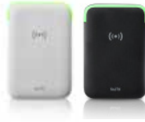
WRDB0A4 (W or B)